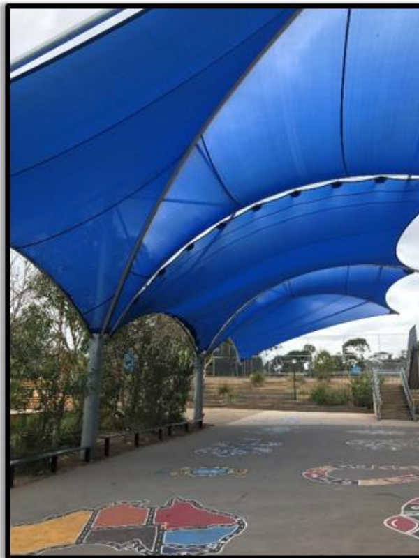
Blue Shade Sails and Artist Commissioned Playground Art