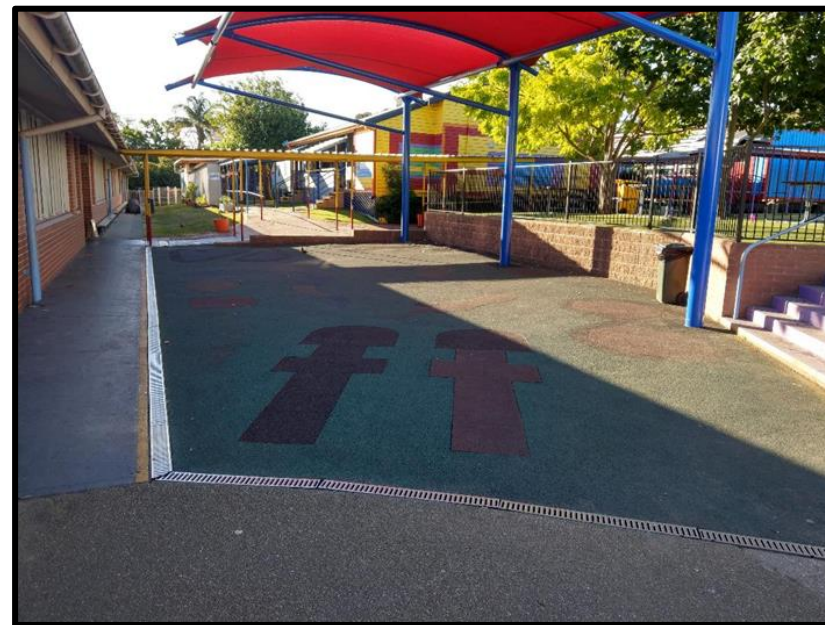
Red Shade Sail and Soft fall play area