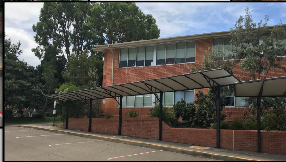
Shelters for Bus Waiting Area and Kiss and Drop