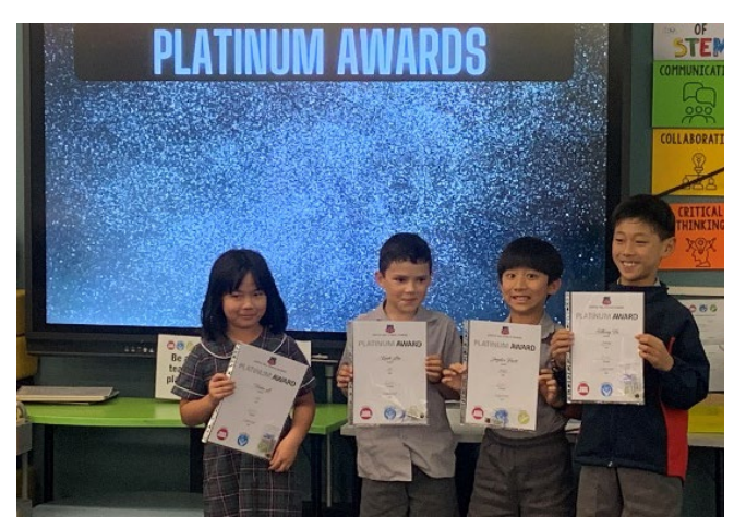
Years 2 and 3

Our Term 1 Platinum Lunch and Presentation was held in the last week of Term 1. Congratulations to the 15 students who received their Platinum Award, we are very proud of your efforts!