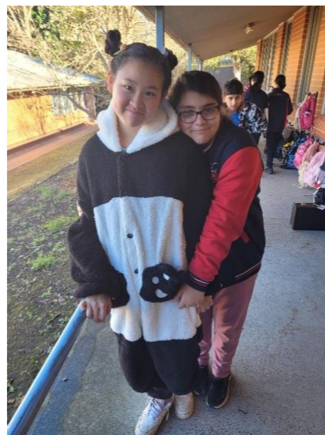
The SRC Team.