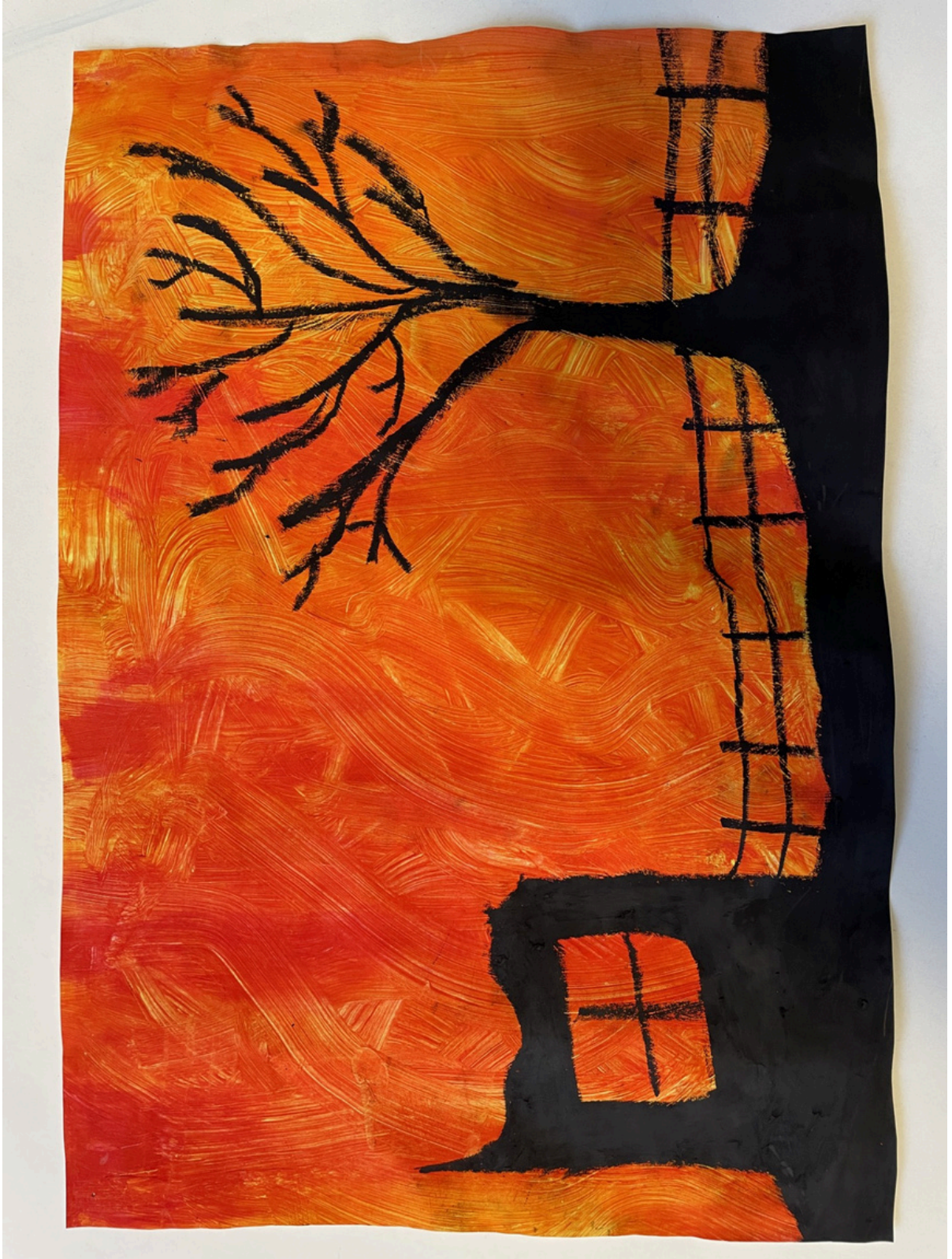
Aulina - 4D